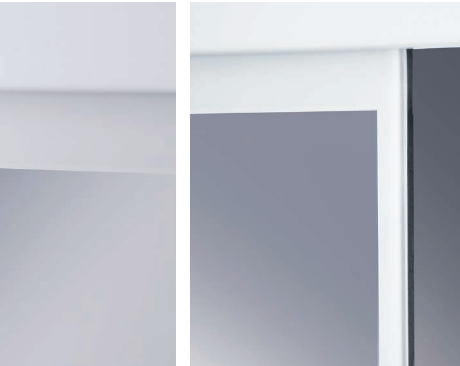
A damper hidden in the frame enables safe and smooth door closing.